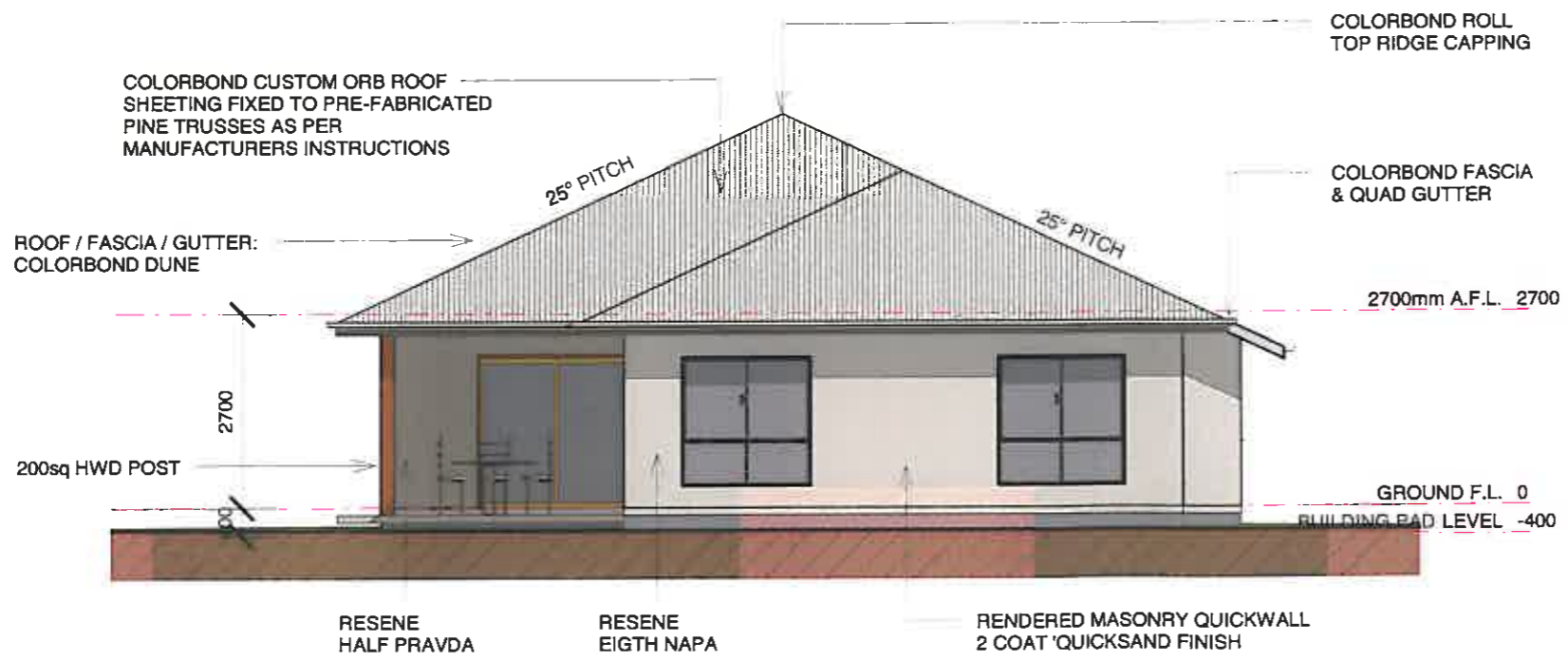
2 NORTH ELEVATION A02 1 : 100

ELEVATION LEGEND RM RENDERED FINISH TO BUILDERS STANDARD